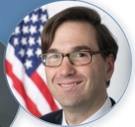
Jason Furman Professor, Harvard Kennedy School