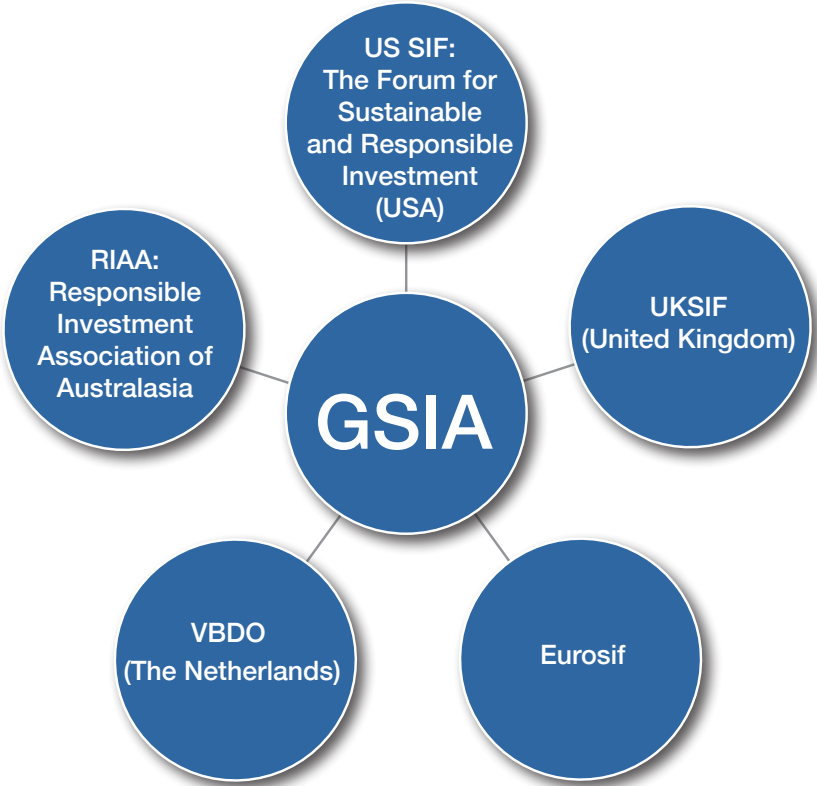
Figure 4.2: Other Membership-based Sustainable Investment Organizations