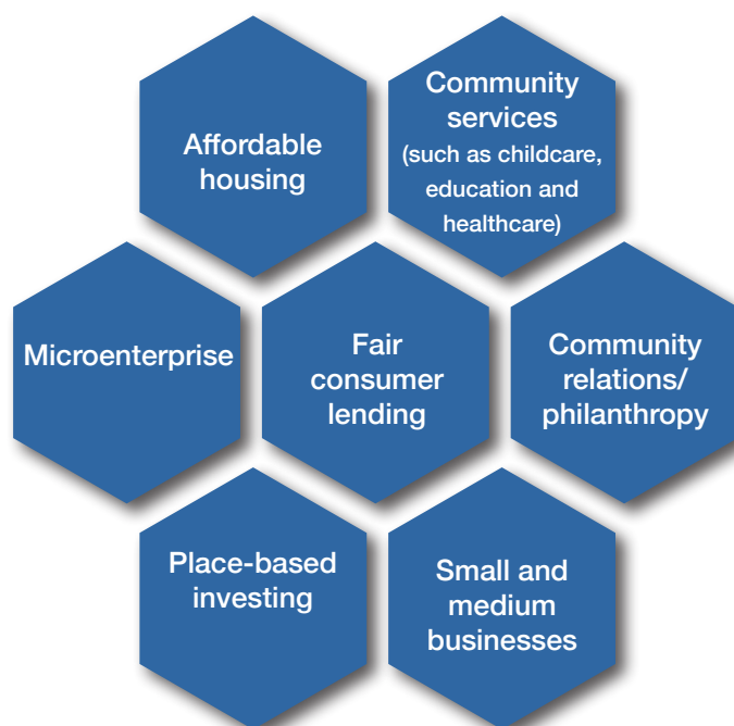
Figure 3: Community Investing: Areas of Impact

The impact of the community investment field on the local, regional and national level in the United States has grown over the years. With expanded investment opportunities across asset classes, community investing serves as another avenue of opportunity for “impact investors.” Examples abound of the ways in which community initiatives by CDFIs and other types of investors have aided individuals, strengthened neighborhoods, and delivered social and environmental benefits. A few are highlighted in this section.