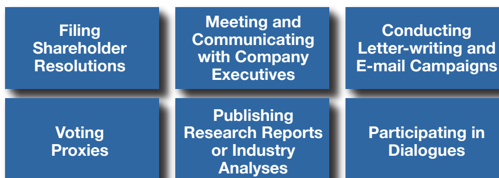
Figure 2.1: Shareholder Engagement Strategies and Tools

Active ownership strategies can create a ripple effect: investors urge a few companies to take action on an issue, and other companies take note and adopt more sustainable policies to avoid becoming the targets of similar shareholder action, or being conspicuous for not having industry-leading policies.