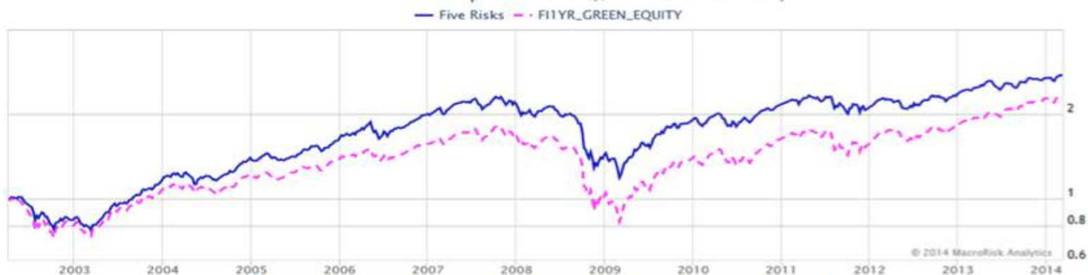
Performance Comparison Chart($1 initial investment)